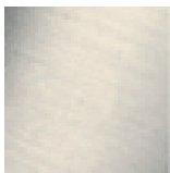
platinum matte 17 861 790-06

Kitchen - Elio HOT & COLD WATER DISPENSER - polished chrome Article number: 17 861 790-00